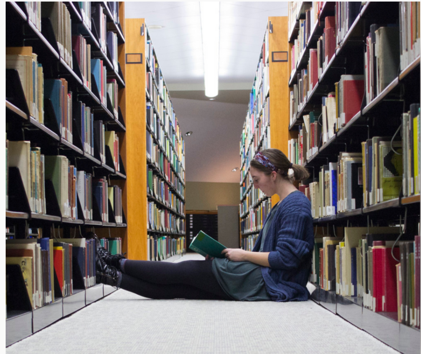
Hanover College Duggan Library

*Fall 2023 enrollment according to Integrated Postsecondary Education Database System ( https://nces.ed.gov/ipeds ).